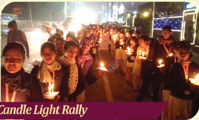
Candle Light Rally