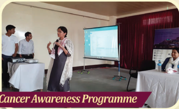
Cancer Awareness Programme