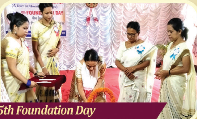
5th Foundation Day