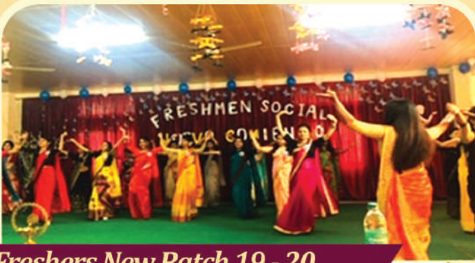
Freshers New Batch 19 - 20