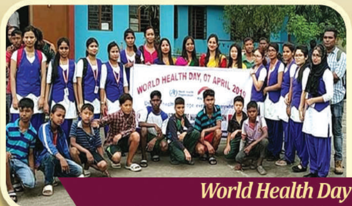
World Health Day