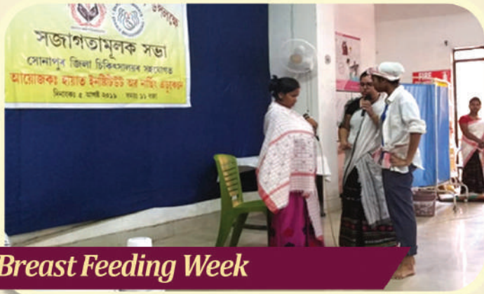
Breast Feeding Week