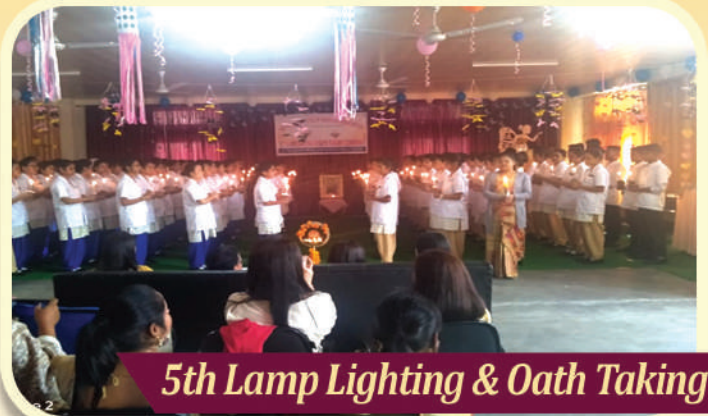
5th Lamp Lighting & Oath Taking