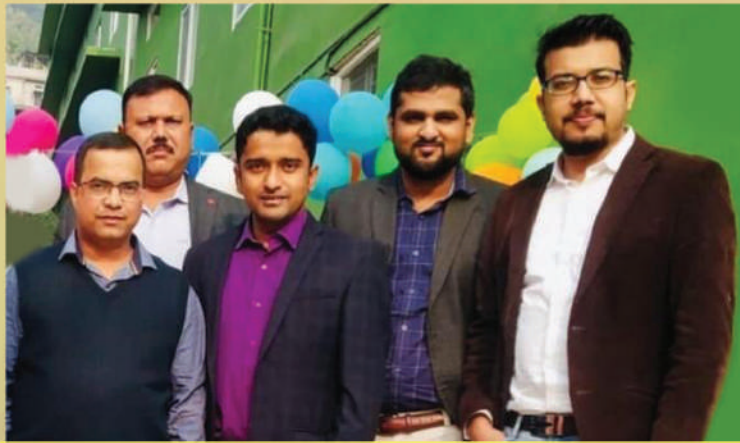
Members of Hayat Foundation