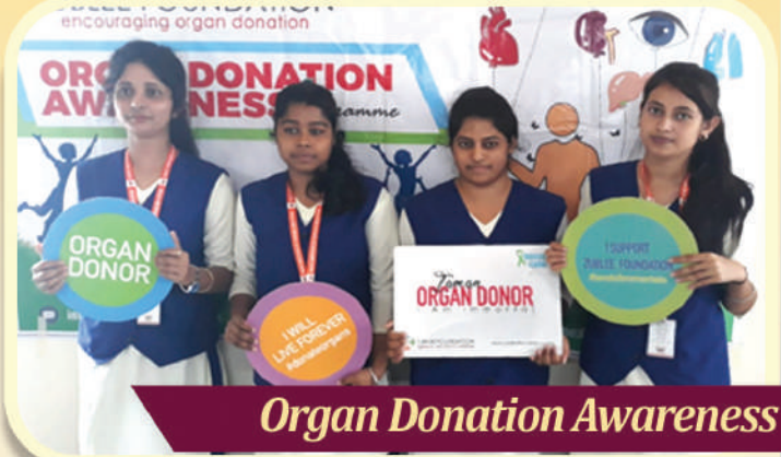
Organ Donation Awareness