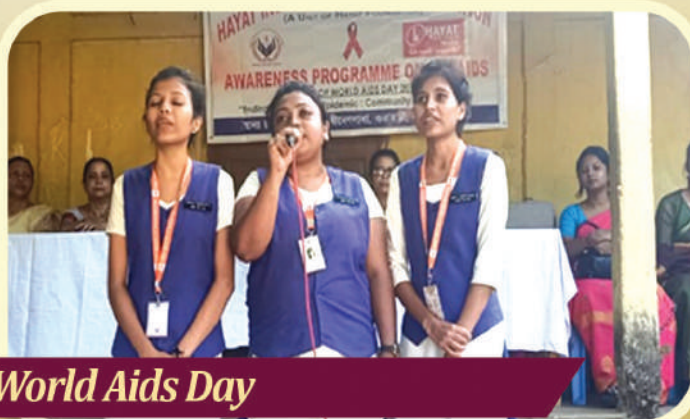
World Aids Day